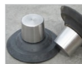
Velcro Driver Pads