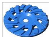
5" & 7" Cup Wheels - always use shallow dish